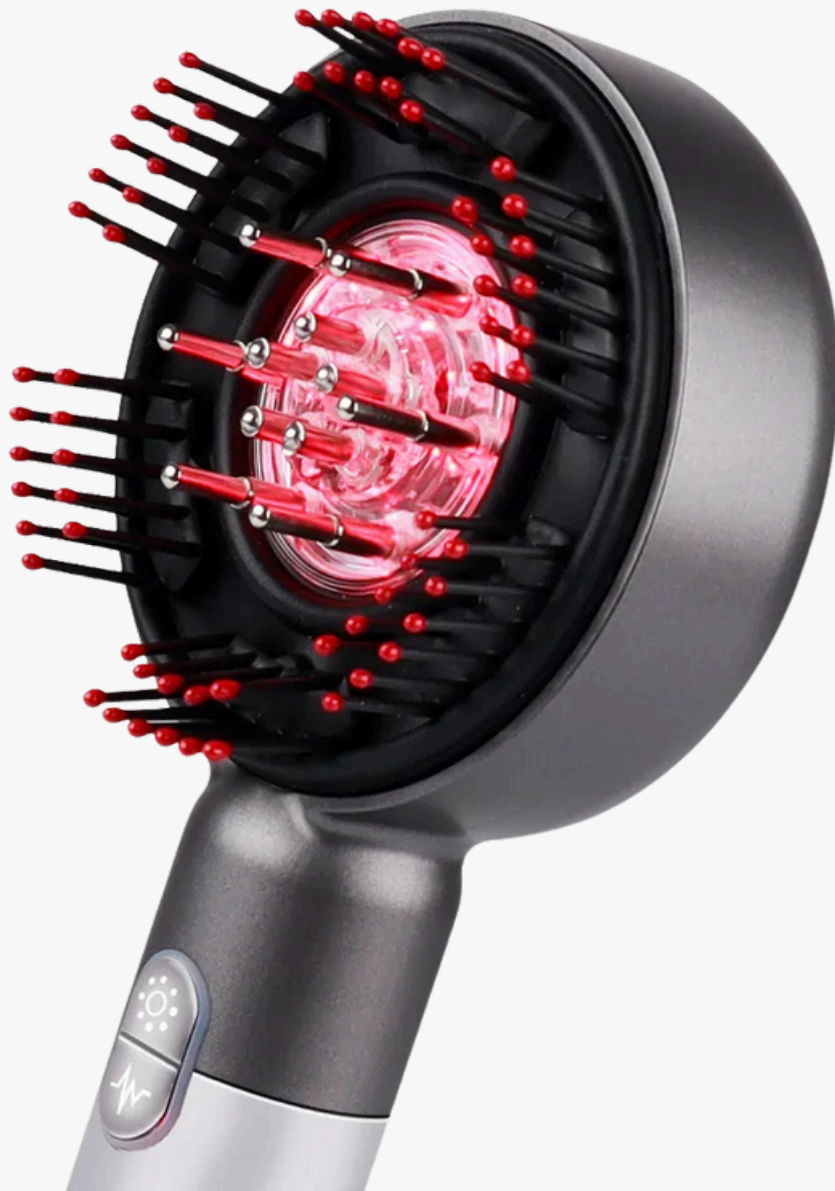
LED ROOT RESCUE BRUSH